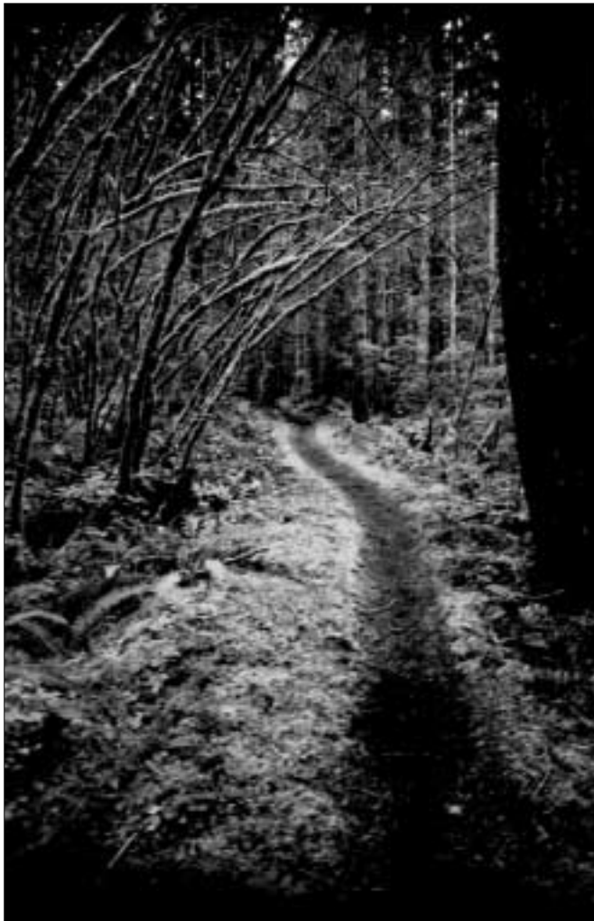
An inviting single track trail...