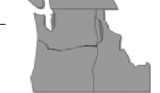
Bicycle Paper covers readers and bike shops in Washington, Oregon, Idaho and southern B.C.